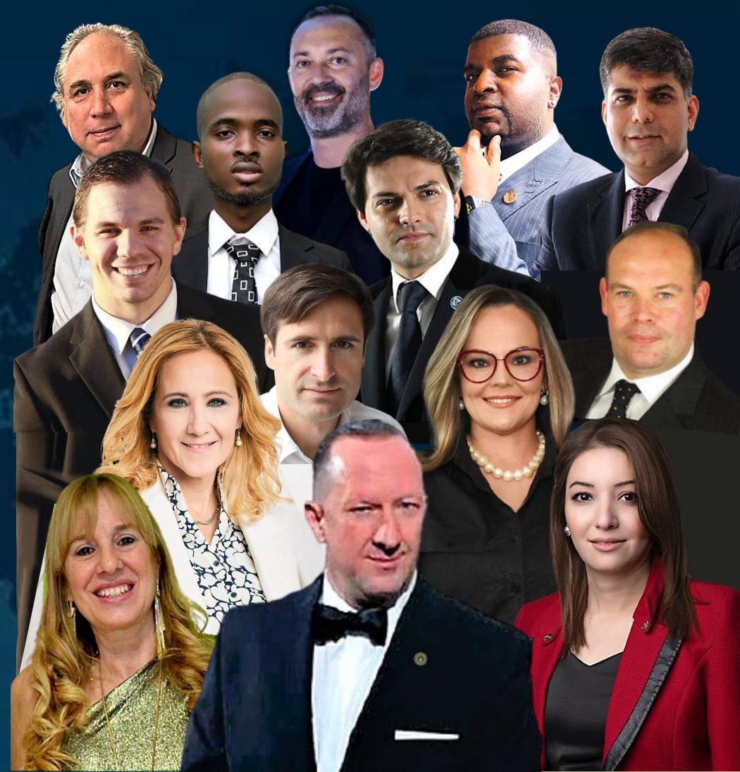
BOARD OF DIRECTORS