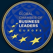
GCBL EUROPE HEADQUARTERS