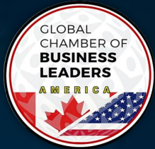
GCBL AMERICA HEADQUARTERS