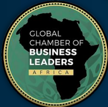
GCBL AFRICA HEADQUARTERS