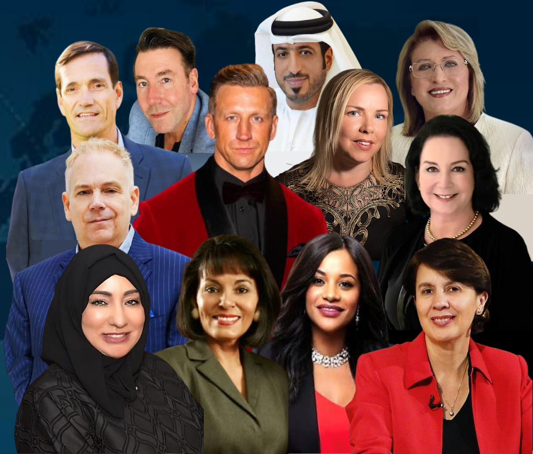
BOARD OF ADVISORS

Find out more : www.gc-bl.org/board-of-advisors